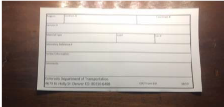
CDOT Form 634 Label (Stick-on Label with high heat durability)